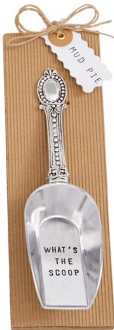
ICE SCOOP | MUD-PIE.COM