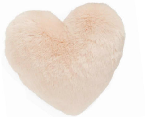
HEART ACCENT PILLOW | NORDSTORM.COM