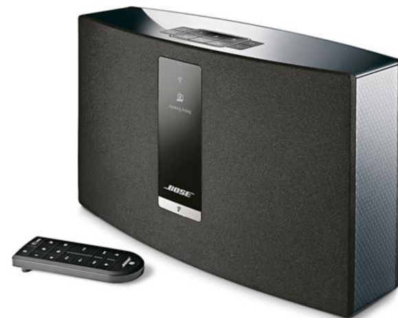
BOSE SOUND TOUCH | STAR-POWER.COM