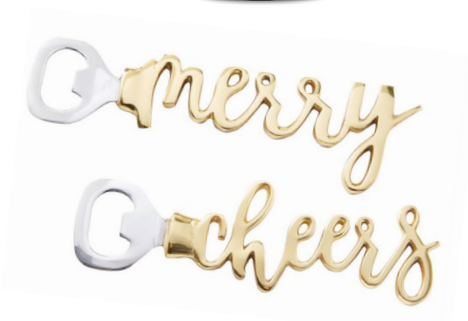
BOTTLE OPENER | MUD-PIE.COM

Select a bottle or join the Hall Wine Club for preferred pricing, complimentary tastings, invitations to special events, and priority access to wines only available from the winery. HALLWINES.COM