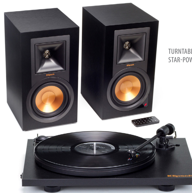
TURNTABLE AND SPEAKER | STAR-POWER.COM