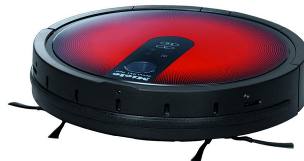
TURNTABLE AND SPEAKER | STAR-POWER.COM