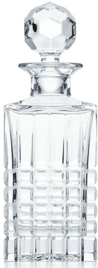
DECANTER | TIFFANY.COM