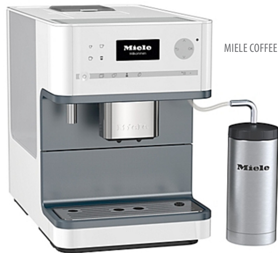
MIELE COFFEE MAKER | STAR-POWER.COM