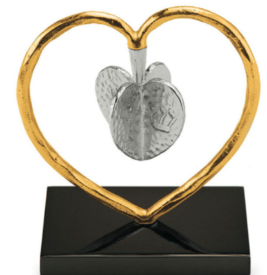
HEART TO HEART DREIDEL