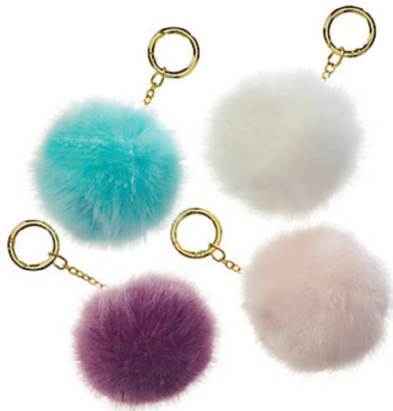
PUFF KEYCHAINS | ZGALLERY.COM