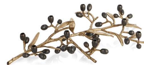
OLIVE BRANCH GOLD MENORAH | MICHAELARAM.COM