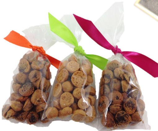
MICROCHIP COOKIES | JKCHOCOLATE.COM

"Bean to Bar" chocolates and custom made specialties. Gift boxes from $15. SUBLIMECHOCOLATE.COM